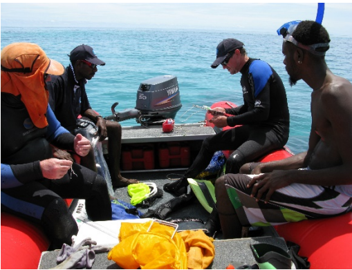
CSIRO scientists and Mer Island co-researchers during a survey in 2009

The Fish Receiver System was introduced in December 2017. There is still however, limited information available to assess the status of fishery populations, with incomplete catch and effort time series data available prior to 2017. A stock survey is presently the only viable method for determining the size and status of fished beche-de-mer populations for Torres Strait.