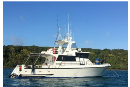
MV Wild Blue

This is the first of two upcoming surveys - please let us know if you have any feedback or questions, and you're welcome to come see what is happening and have a chat during the surveys